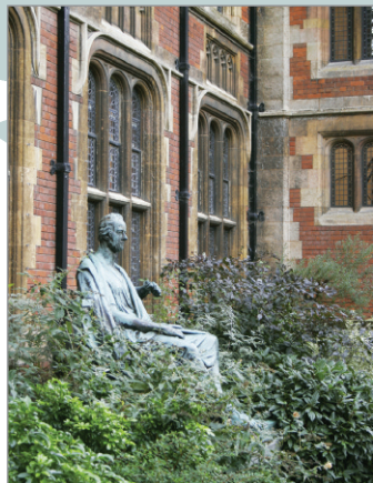
Pembroke College was founded in 1347 by Marie de St Pol, the Countess of Pembroke, and is such as the third oldest of Cambridge's colleges. Other notable features of the college include the first chapel to be designed by Sir Christopher Wren, and this stunning sculpture of William Pitt the Younger, a fellow of the college who went on to become the youngest British Prime Minister at the age of 24, in 1783.