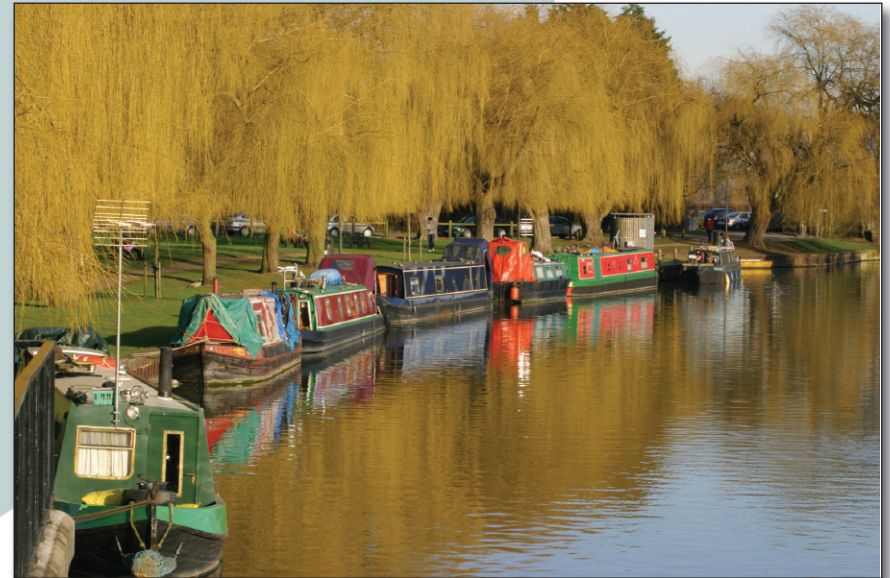
Narrowboats at Ely on the Great Ouse. There's a superb network of rivers, lodes, and channels throughout the fens for boat owners to explore.