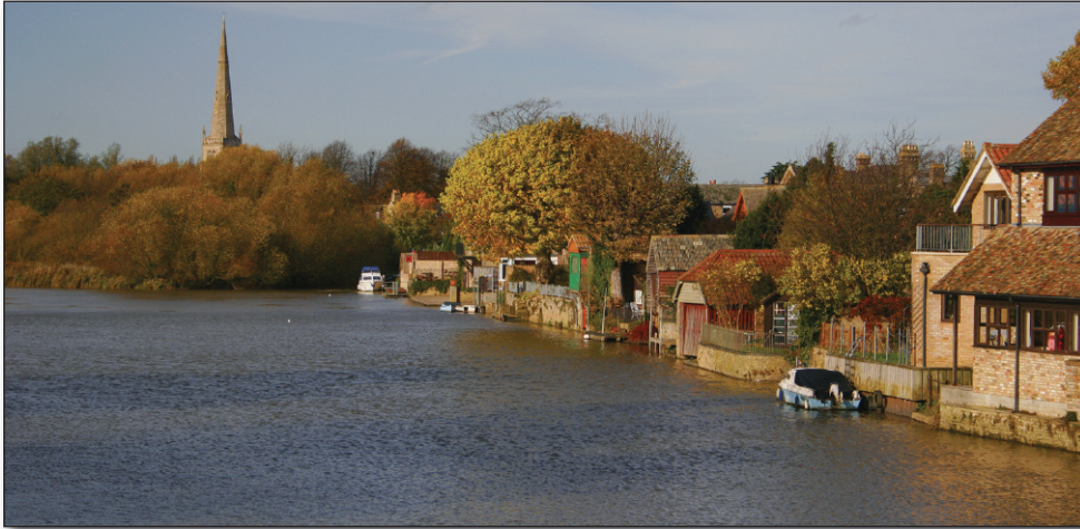
Looking up the River Great Ouse from the Chapel on the Bridge in St Ives, towards All Saints' Parish Church.