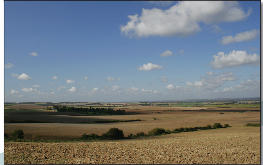
The rolling chalk hills of southern Cambridgeshire from near Heydon.