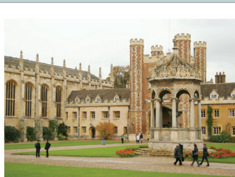
Trinity College was founded by Henry VIII in 1546, combining the old King's Hall and Michaelhouse. This is the Great Court, with the Great Gate hiding behind The Fountain.